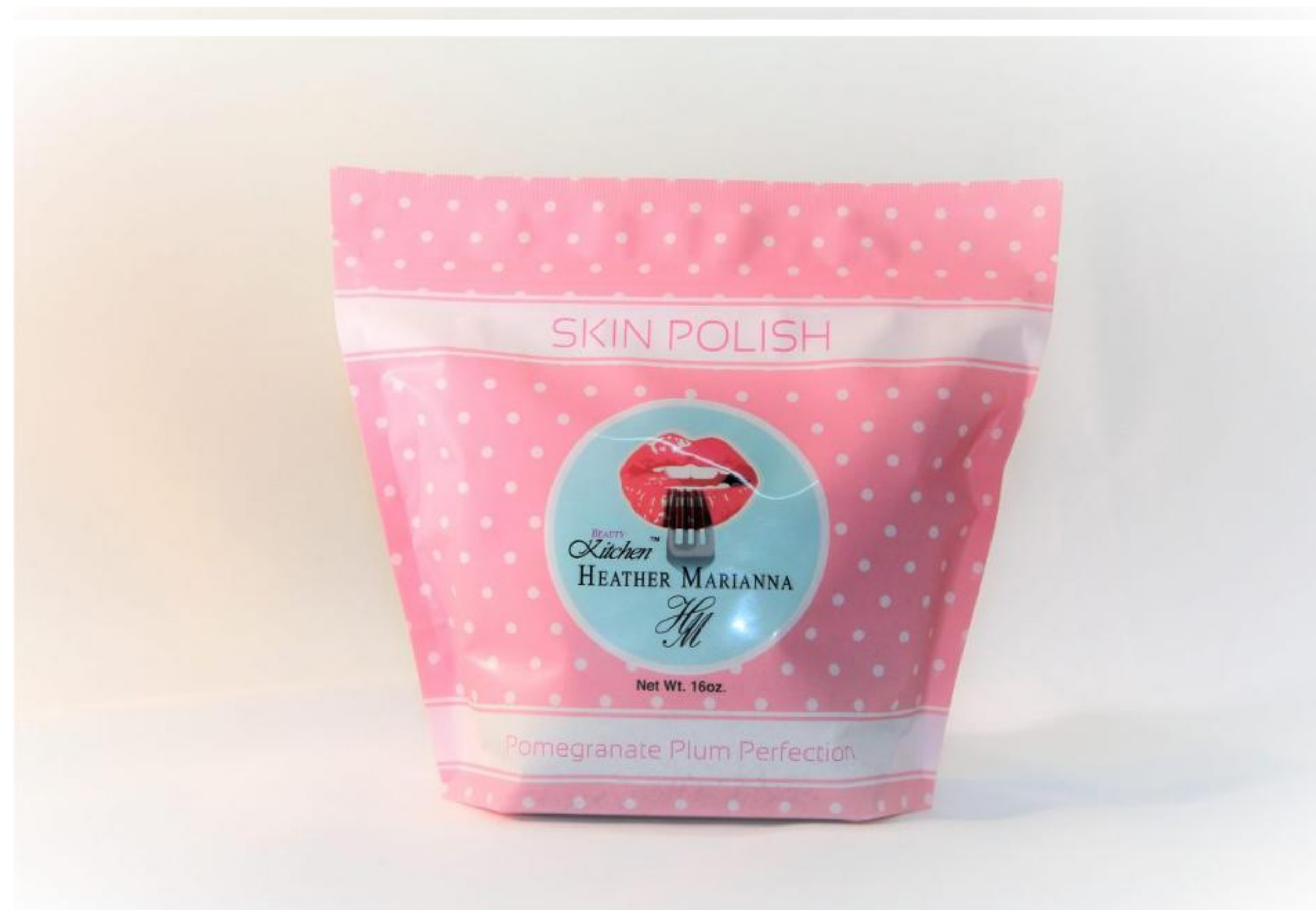
Beauty Kitchen by Heather Marianna Pomegranate Plum Perfection Skin Polish | $22.50

This sugar scrub is the perfect gentle exfoliant for your body après le bain , so be sure to have it handy when you're ready for an at-home spa treatment. Simple ingredients make it a great choice for sensitive skin.